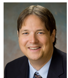
Dr. Robert Ekey Distinguished Service Award