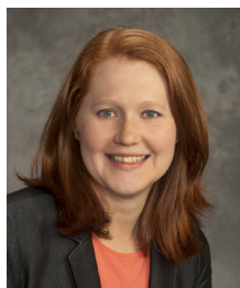
Dr. Richelle Teeling-Smith Distinguished Teaching Award