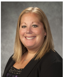
Rachel Cummings Great Teacher Award