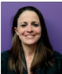
Leslie Shaffer Outstanding Adjunct Award