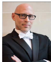
Dr. Grant W. Cook III Distinguished Scholarship Award